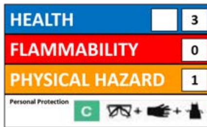
HMIS (Hazardous Material Information System)