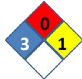
NFPA (National Fire Protection Association)

Information contained in this publication or as otherwise supplied to Users is believed to be accurate and is given in good faith, but it is for the Users to satisfy themselves of the suitability of the product for their own particular purpose. Jack's Magic Products, Inc. gives no warranty as to the fitness of the product for any particular purpose and any implied warranty or condition (statutory or otherwise) is excluded except to the extent that exclusion is prevented by law. Jack's Magic Products, Inc. accepts no liability for loss or damage (other than that arising from death or personal injury caused by defective product, if proved), resulting from reliance on this information. Freedom under Patents, Copyright and Designs cannot be assumed.