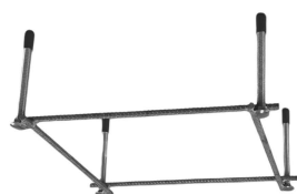
4 Bolt Jig for 4 Bolt Base

To select a color for board or base, add corresponding color code to the end of the part number above. To order 4 bolt base with NO JIG, replace "4B" with "4BNJ".