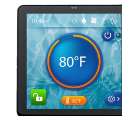
Alarm display, diagnosis and solution

Manage settings and easily access all system information