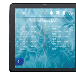
History access (last 50 events)