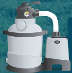
KRYSTAL CLEAR™ SAND FILTER PUMP