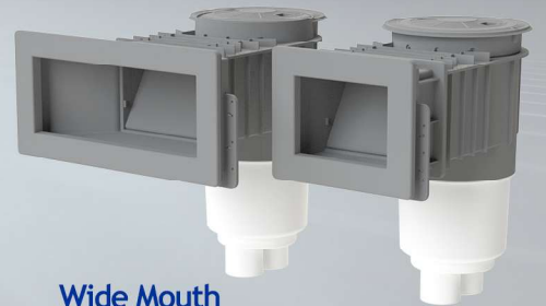
Wide Mouth Model # SKR36xxx Standard Mouth Model # SKRVFL3Nxxx

Developed from an idea collaboration with some of the best minds in the industry the Flow Star Skimmer is packed with features that bring ease of installation and customization to builders, and high-end performance for pool owners, see back for more details . All Flow Star Skimmers are manufactured in the United States using only the top quality materials and craftsmanship.