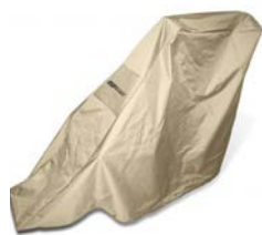
Splash!, aXs2, multiLift & ML300 920-5000T, AX9006, 500-5200T