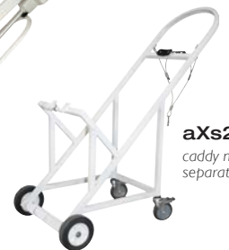
aXs2 caddy not sold separately